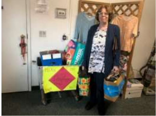
Above: Delivery of children's clothing collected during Lent to MACC.

The Missions Committee would like to thank all who donated children's clothes for MACC on Palm Sunday. We were able to deliver several boxes and bags of clothes to them and they were very grateful for our donation.