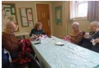
Many volunteers teamed up to make tie-fleece blankets for SWPD cruisers, providing comfort for children in need.