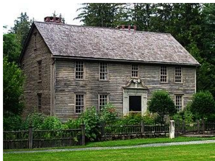
The Mission House, Stockbridge, MA